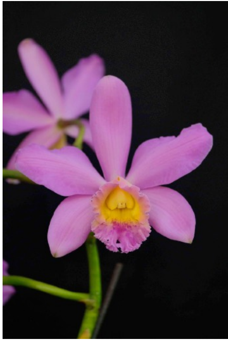
Ctt. 'Louisiana' AM 81 Al Taylor