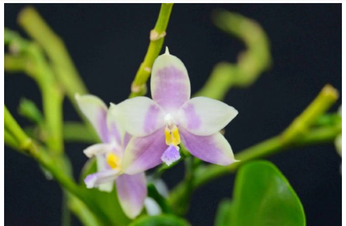
Phal. Happy Camping 'Bravo' HCC 76 Jackie Bravo