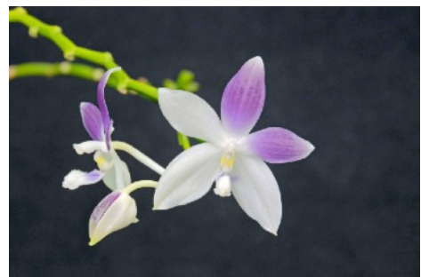
Phal. tetraspis fma. speciosum 'Bravo' AM 81