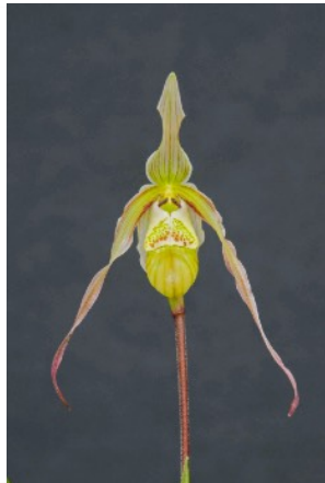
Phrag. pearcei bar. ecuadorensis 'Catahoula Charm' HCC 78 Eron Borne