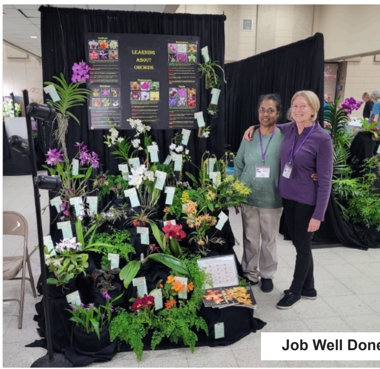
Job Well Done!