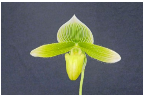
Paph. Oriental Appeal 'Louisiana' AM 80 Al Taylor