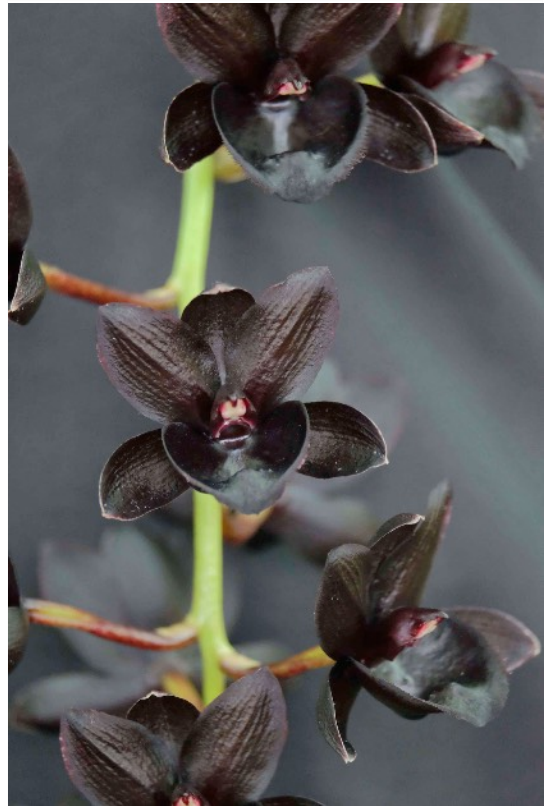
Fdk. Midnight Depth 'Louisiana' AM 80 Al Taylor