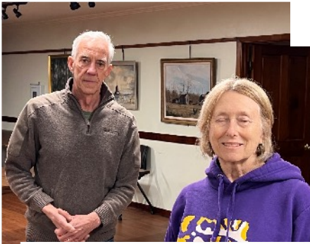
Working Hard to Prepare for the Show!