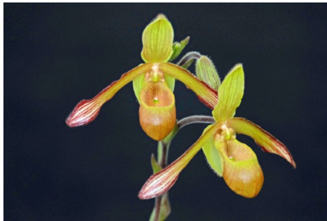
Phrag. lindleyanum var. kareteorum 'Catahoula' CHM 86 Eron Borne