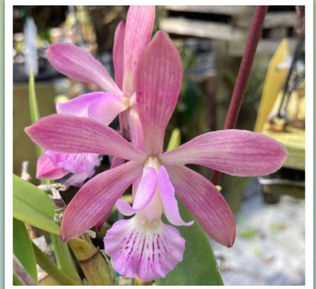
Epc. Jungle Jim #4